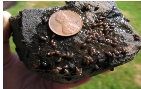
Size comparison with a penny

New Zealand mud snails are very small and easily overlooked. A single juvenile, essentially invisible to the unaided eye, transported to Santa Rosa or Santa Cruz Islands could be enough to permanently alter their freshwater communities.