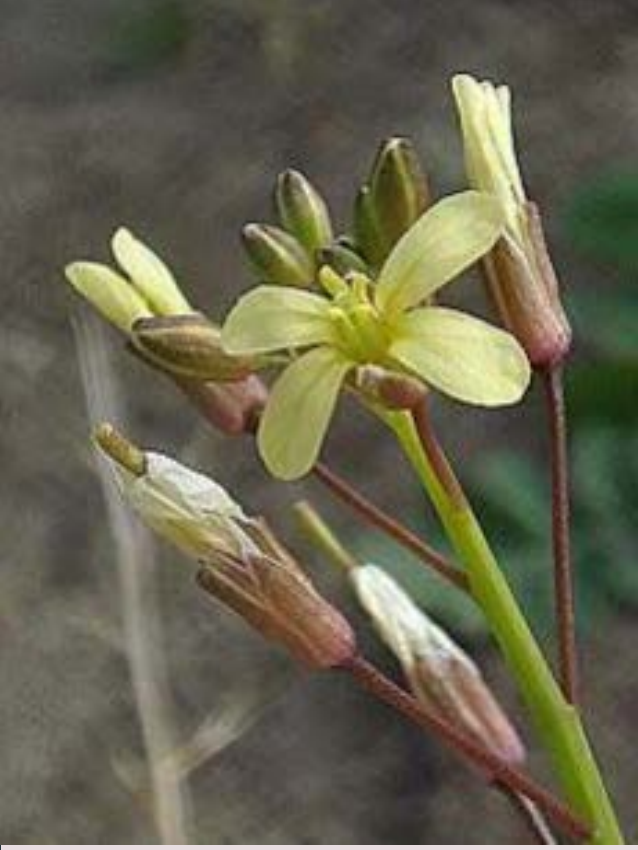
Saharan Mustard or African Mustard Brassica tournefortii