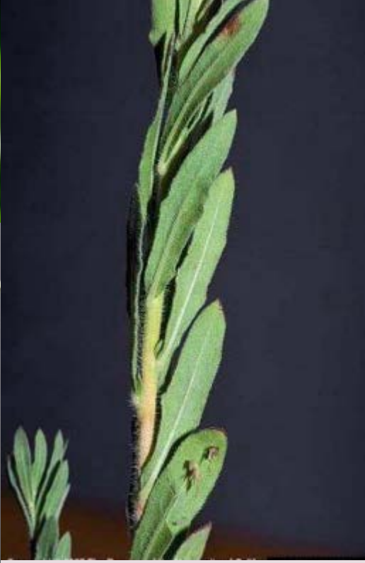
Drummond's Beeblossom or Scented Gaura Gaura drummondii