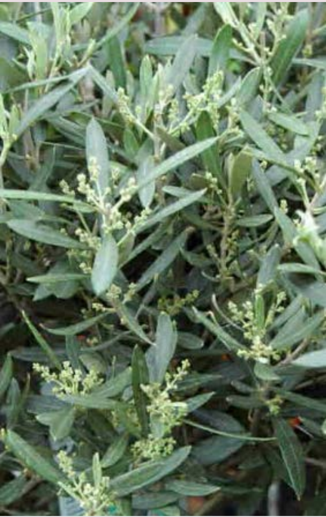
Olive Olea europaea