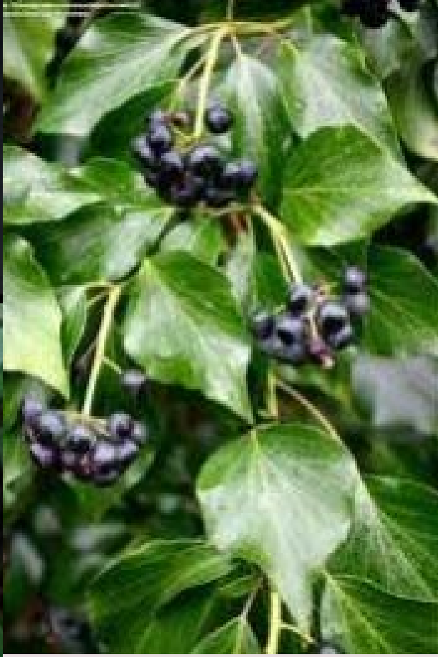
English Ivy and Algerian Ivy Hedera spp.