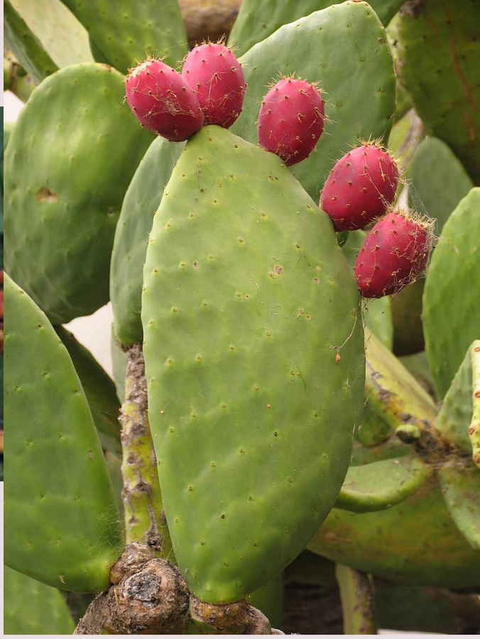
Mission Cactus Opuntia ficus-indica