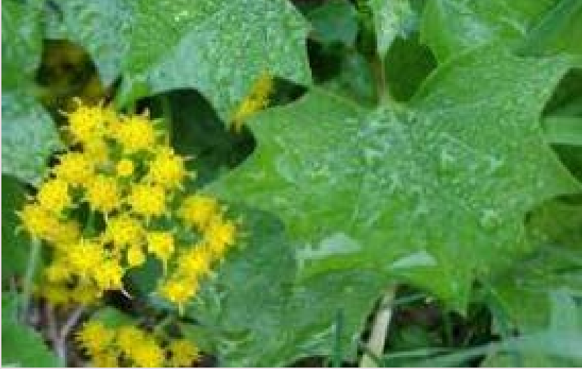
Cape Ivy or German Ivy Delairea odorata