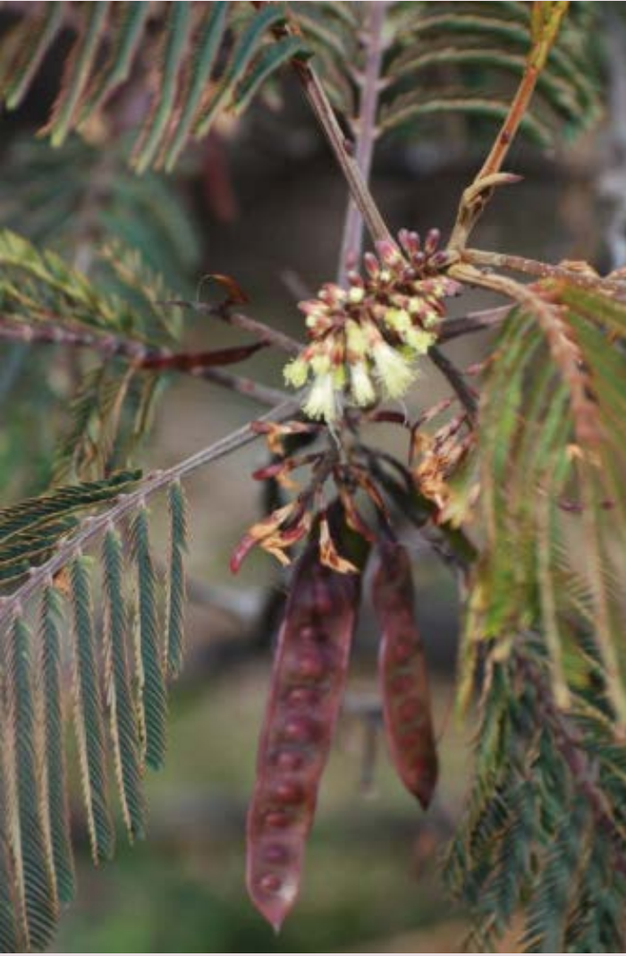
Plume Acacia Paraserianthes lophantha