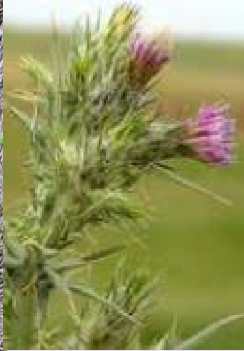
Italian Thistle Carduus pycnocephalus