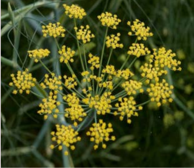
Fennel Foeniculum vulgare