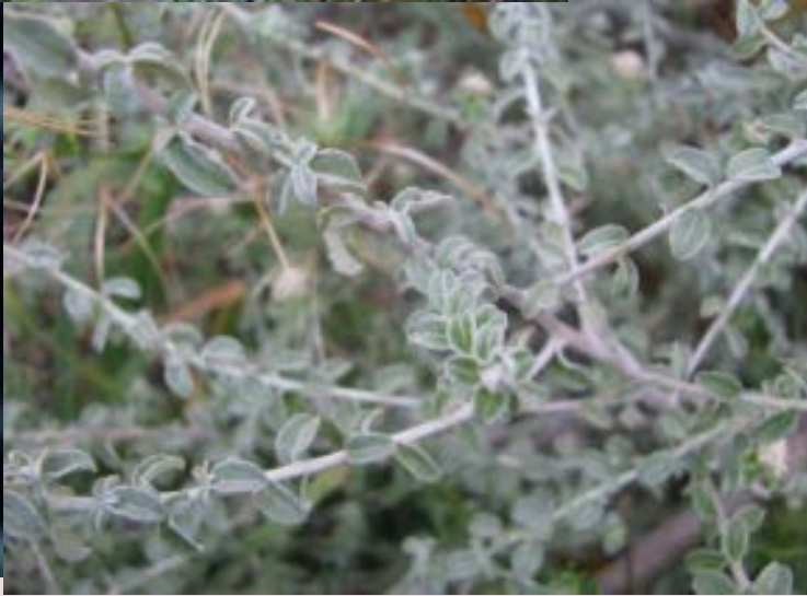
Licorice Plant Helichrysum petiolare