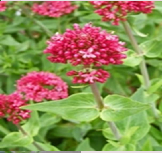
Jupiter's Beard or Red Valerian Centranthus ruber